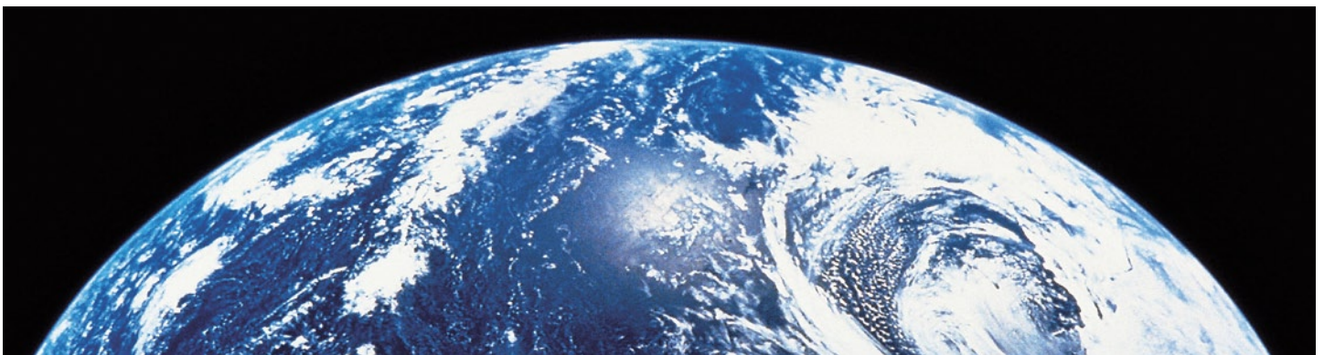
An affluent planet: global HNWIs increased by 7% in 2004