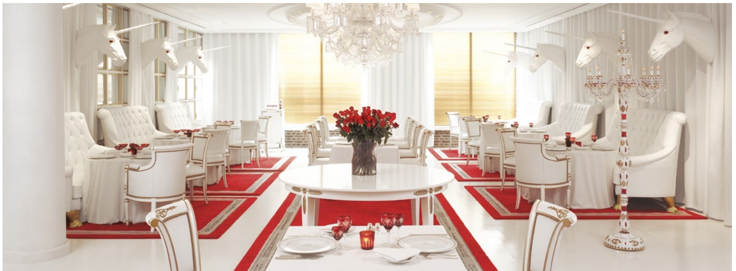
The dining room at the Faena Hotel + Universe, Buenos Aires, designed by Phillipe Starck; where guests are met by Experience Managers

At Louis Vuitton's Paris flagship store, the seventh floor art gallery is integral to the store, and has become a tourist attraction in its own right.