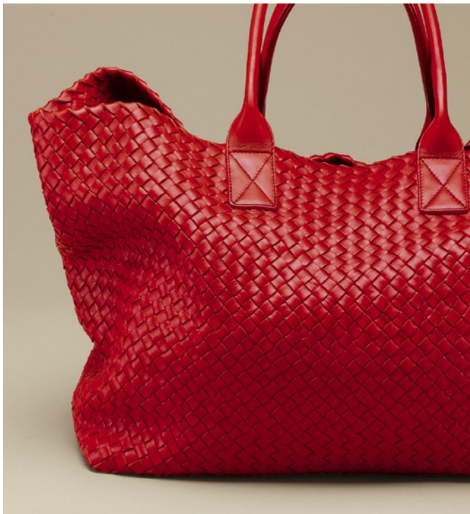
Value for money on a luxury level: Cabat handbag by Bottega Veneta

What's more, consumers seeking value luxury are looking to gain the greatest possible pleasure from an item, experience or service. So brands must continue their quest to be the best in their sector as consumers take a less-is-more approach, spending more on one thing that they really love than a number of things that do not fulfil their concept of true value.