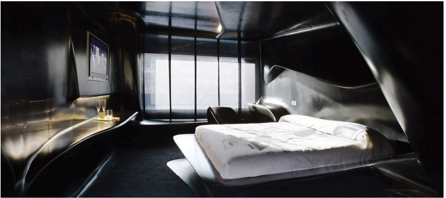
Authoritative luxury courtesy of Hotel Puerta América, Madrid, Silken Hotels. Bedroom designed by architect Zaha Hadid

Supporting this is the increased knowledge of consumers who, buoyed by rising personal wealth and the desire to spend more intelligently, are embarking on food pilgrimages and food safaris – eating their way around the world in new, innovative ways.