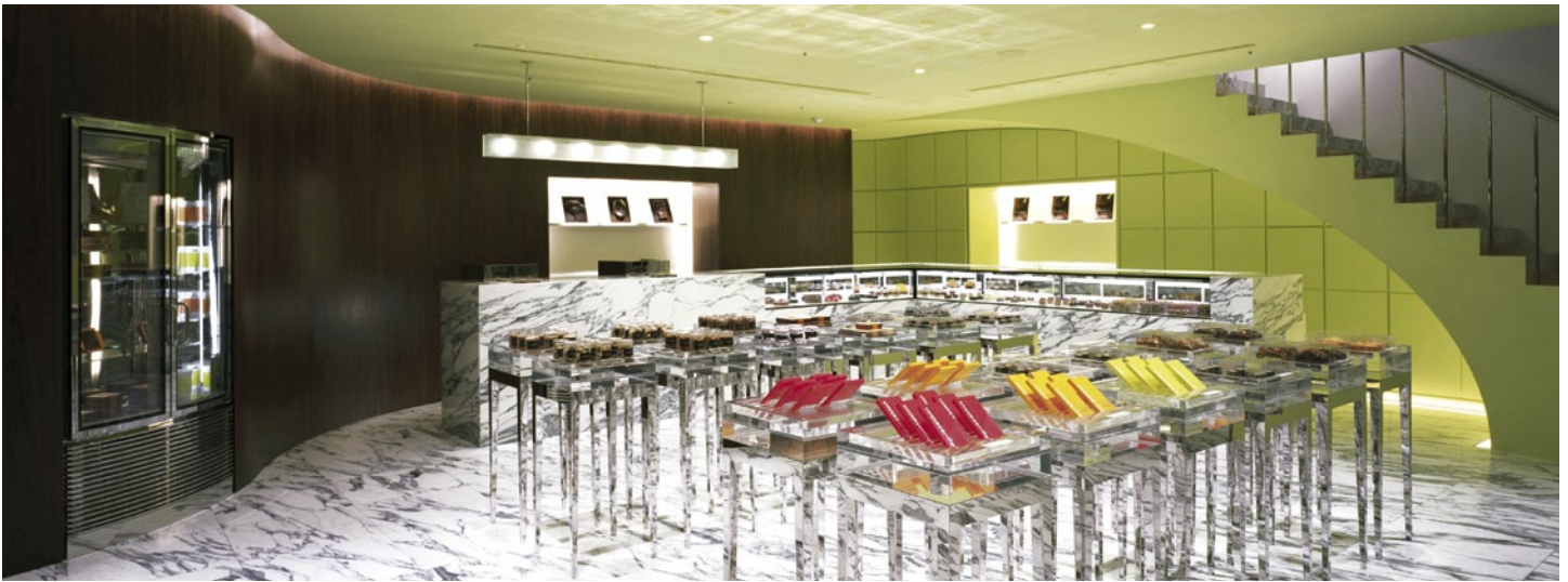
Chocolate shopping taken to new levels: Pierre Hermé's Tokyo boutique designed by Masamichi Katayama and Wonderwall

Consumers are more inclined to purchase a luxury product when it is designed to appeal to more than one of the senses. Hence the rise of gastroboutiques like Pierre Hermé in Paris and Tokyo or Habits Culti in Milan, where exquisite food is combined with a luxury shopping experience; and the increased prominence of cutting-edge designers like Marcel Wanders, Barnaby Barford and the Campana brothers, whose works are becoming tomorrow's collectables by blurring the line between furniture and art.