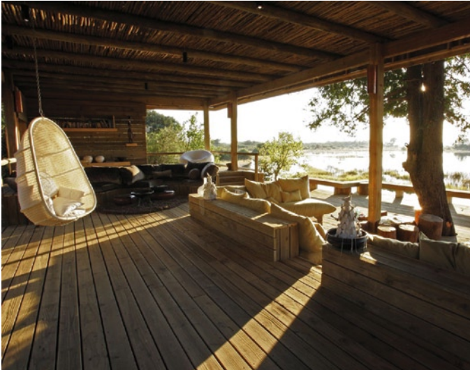
Where luxury won't cost the earth: Vumbura Plains resort, Botswana.