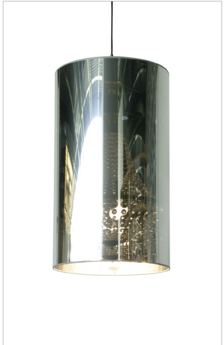
Changing notions of luxury: Jurgen Bey's Lightshade-shade from the 'Life of Products' collection, Droog Design

As consumers progress through the luxury cycles, each one of these attitudes becomes increasingly prevalent. Examples of this are highlighted in the pages that follow from the design, fashion, food and travel sectors.