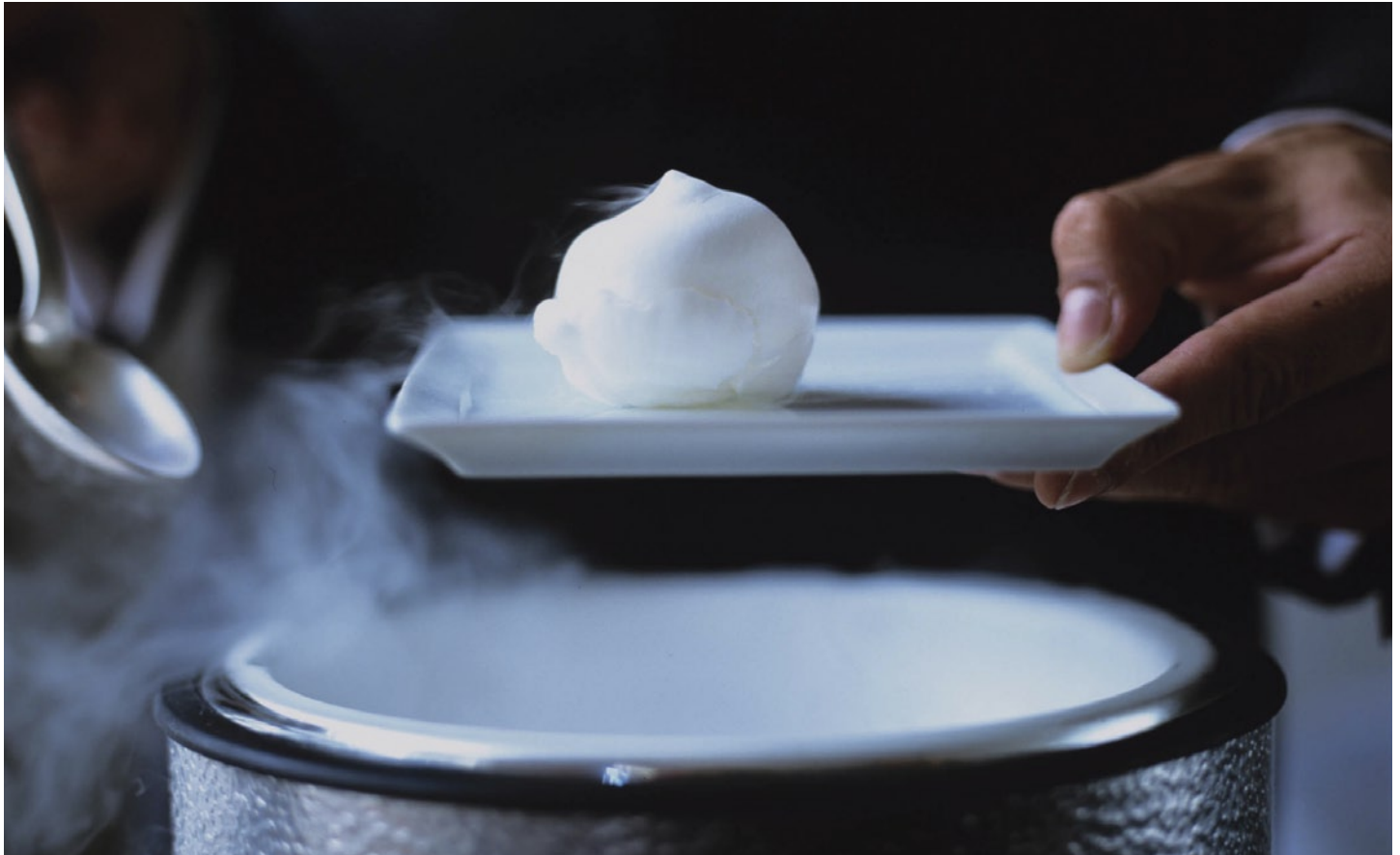
Where food and science meet: Green tea and lime mousse poached in liquid nitrogen by chef Heston Blumenthal.

The significant role of knowledge can be seen most clearly in the food sector, where the rebooting of interest in the world of food stems ultimately from increased responsibility for one's own wellbeing. Again, cross-platform luxury is apparent: the rise in molecular gastronomy led by Spain's Ferran Adrià and Britain's Heston Blumenthal, is becoming another pillar in understanding food. Good nutrition, and the quality and provenance of food are key. As Ferran Adrià, chef at El Bulli explains: "The nut is as good as caviar; rice is as good as lobster. This is the philosophical thinking on which my work with food and the senses is based."